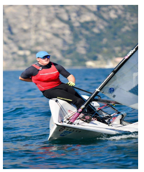
Youth Winter Training