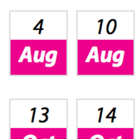
Events for your Diary